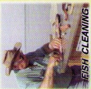
FISH CLEANING STATION

A Christian Living Publication - 352-875-4485